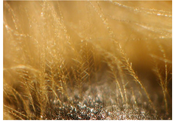
Figure 4. Close-up of feathery hairs on a honey bee, which are well adapted to collect pollen.

• Bees have hairy bodies, the hairs are very feathery in appearance (Figure 4) and are capable of trapping and holding large numbers of pollen grains.