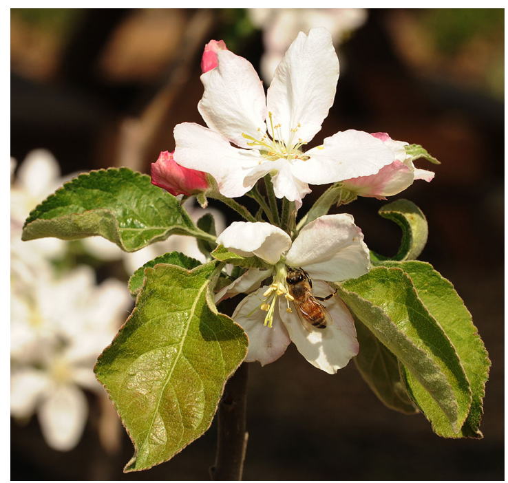
Figure 1. Honey bee collecting nectar from an apple blossom.

What is pollination? Pollination is the transfer of pollen from the male part of the plant to the female part of the plant of the same species. Figure 1 shows a honey bee pollinating an apple blossom. The anthers, the male part of the flower, produce pollen. The pollen must be transferred to the upper female part of the flower, the stigma. Here the pollen germinates and grows down the style (the elongated portion of a pistil that connects the ovary with the stigma of a plant) (see Figure 2) to where fertilization occurs and the seeds develop in the ovaries. A fruit is a ripened ovary. Usually transfer of pollen occurs with the help of animals (insects, birds, and bats), but gravity, wind, and water can also transport pollen (Willmer 2011).