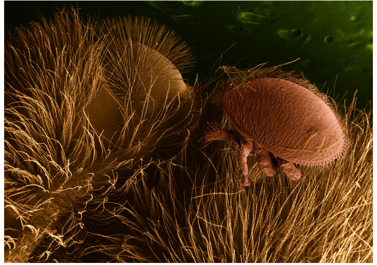
Figure 5. Varroa mite, Varroa destructor, on a honey bee.

There are many factors involved in the decline of honey bees—one of the most notable is a parasitic mite ( Varroa destructor ) that vectors (transfers) pathogens. This mite is a major threat to the U.S. honey bee industry. It is directly and indirectly responsible for the loss of tens of thousands of honey bee colonies every year. Varroa first appeared in the United States in 1987. This mite weakens honey bees (Figure 5), making them more susceptible to toxins and pathogens such as viruses, bacteria, and fungi. The Varroa mite is by far the largest single cause of honey bee decline. However, the decline in bees is complex and researchers have identified multiple variables contributing to their decline.