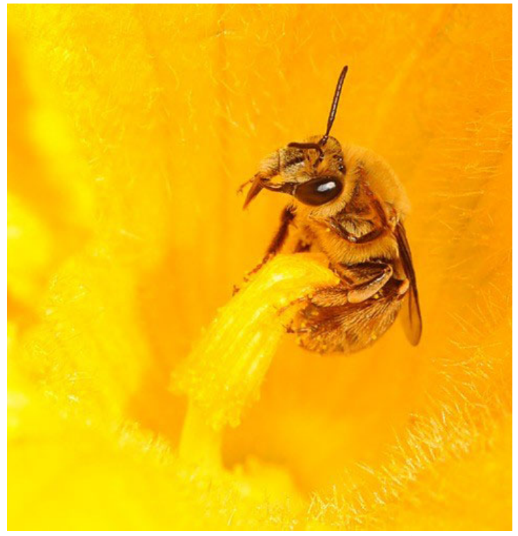
Figure 3. Close-up of the tiny squash bee, genus Peponapis .

Some pollinators visit many different types of flowers during the day, which is good for the insect but not the best strategy for the plants it visits. A pollinator that visits many different kinds of flowers will transfer pollen, but it may not transfer enough of the right type of pollen for the plant to set seed and produce fruit. Transfer of the wrong type of pollen could actually reduce the chances of seed set, by clogging the stigma. A plant that must be cross-pollinated needs pollen from a compatible plant of the same species to land on its female receptor (the stigma) to succeed in setting seeds and producing fruit. Honey bees are generalists as a colony. Forager bees from one hive can visit many different species of plants, but each bee is a specialist, visiting only one type of flower on each flight. Other types of bees are true specialists. For example, the squash bee (Figure 3), a very common bee throughout North America, visits only plants that are in the cucurbit family (that is, cucumbers, pumpkins, zucchini, melons, etc.).